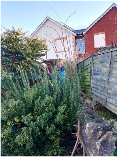
Beds at Albert Road. Lots of shrubs needed cutting back too!